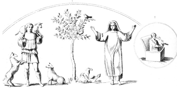
The Good Shepherd, the Blessed Virgin Mary, and Noah with a dove symbolically represented, 3rd century frescoes in the catacombs near Rome

The story of creation in the book of Genesis is