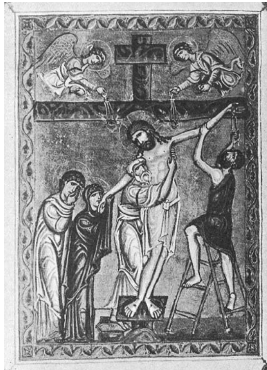
Descent from the Cross, 12th century miniature, Psalter of Queen Melisenda of Jerusalem

“Although each person’s relationship with our Lord is unique, all of us share the same call to live as his disciples.”