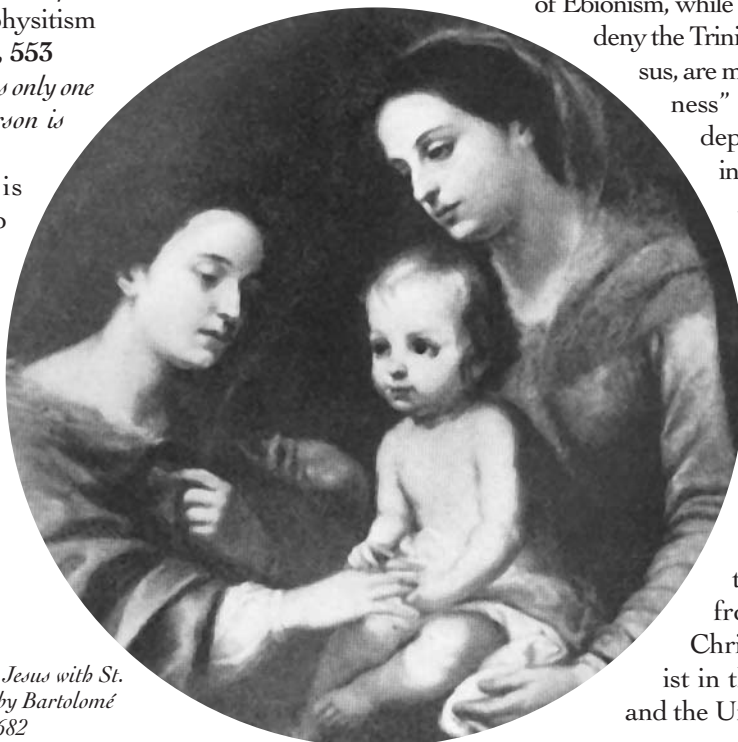
The Virgin Mary and child Jesus with St. Catherine of Alexandria, by Bartolomé Murillo, 1617-1682

❖ “Jesus is not fully divine” : Nestorian Christian communities that directly descend from the first Nestorian Christian communities exist in the Middle East, India, and the United States.