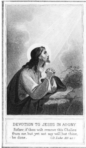
Jesus prays in the Garden of Gethsemane

This type of heresy, like the heresies that denied Jesus' humanity, arose by the end of the 1 st century. The first was the assertion that he was only a man on whom the Holy Spirit came to rest at his baptism (Ebionism). In the 2 nd and 3 rd centuries, a variation