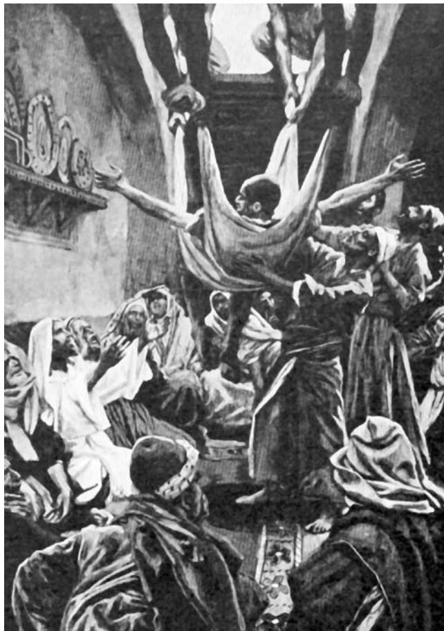
The palsied man let down through the roof, by James Tissot, 1856-1902

It is not difficult to find Scripture passages attesting either to Jesus' identity as God or to his true humanity. The Gospel of John states unambiguously, from the very beginning, that Jesus was God: "In the beginning was the Word, and the Word was with God, and the Word was God" (Jn 1:1). Several verses later, John writes that God has visited his people in human form: "And the Word became flesh and dwelt among us" (Jn 1:14; see also 1 Jn 4:2). "Lord," the normal substitute for the unspoken and unpronounced Name of God in the Old Testament — YHWH in the Hebrew script (which used only consonants) — was used in the Gospels and other books of the New Testament for both the Father and for Jesus, both by Jesus himself (see Mt 7:21-22; Mk 5:19; Jn 13:14) and by his followers (see Mt 8:25; Mt 9:28; Mt 14:28-30; Mk 16:19-20; Lk 5:8; Lk 7:19; Lk 10:1; Jn 9:38; Jn 11:27; Jn 20:28; 1 Cor 1:3; 1 Cor 8:6; Phil 2:11; Jude v 4; Rv 17:14).