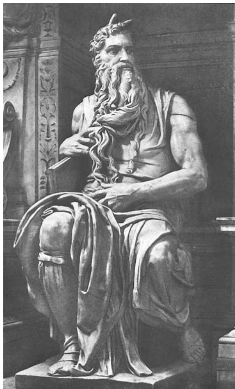
Statue of Moses, by Michelangelo Buonarroti, 1475-1564

The book of Exodus opens with the initial prosperity of the Israelites in Egypt and their later enslavement. Yet “the more they were oppressed, the more they multiplied” (Ex 1:12). Eventually this led the Pharaoh (the ruler of Egypt) to order the murder of every boy at birth (see Ex 1:15-22). It was to this generation of children that Moses was born, and saved through the ingenuity of his mother and sister and the pity of one of Pharaoh’s daughters (see Ex 2:1-10). Grown to manhood, Moses murdered an overseer who was beating a Hebrew slave, and