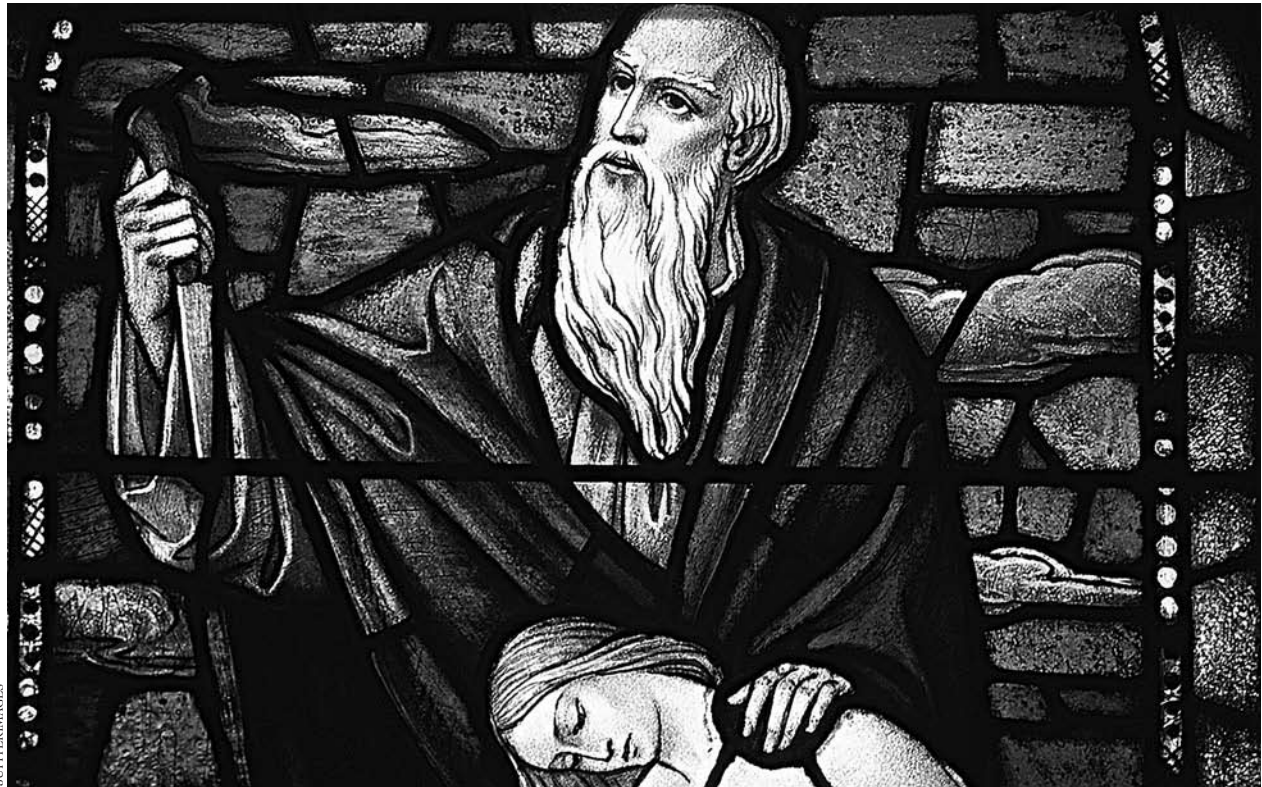
Abraham willing to sacrifice his son Isaac

bless you, and make your name great, so that you will be a blessing. I will bless those who bless you, and him who curses you I will curse; and by you all the families of the earth shall bless themselves” (Gn 12:2-3). We see in this wonderful promise the seed not only of God’s Chosen People, the Israelites, but of the Church itself.