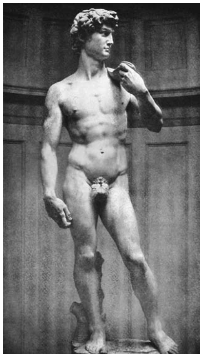
Statue of David, by Michelangelo Buonarroti, 1475-1564

“It is with the great King David that God seals the last of the Old Testament covenants.”