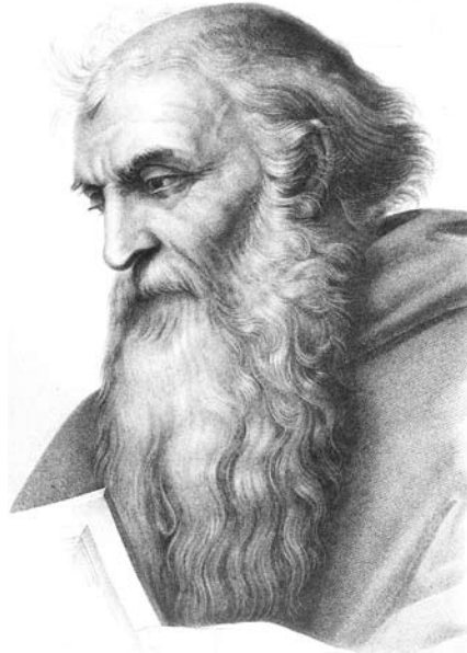
St. Jerome, author of the Vulgate in the late 4th and early 5th centuries, the first major translation of the Bible from Hebrew and Greek into Latin, drawing by Ferréol Bonnemaïson, 1766-1826, after a painting by Raphael

"But as for you, continue in what you have learned and have firmly believed, knowing from whom you learned it and how from childhood you have been acquainted with the