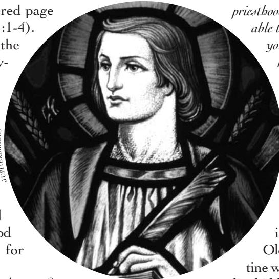
Stained glass window of St. John the Evangelist

Come to him, to that living stone, rejected by men but in God's sight chosen and precious; and like living stones be yourselves built into a spiritual house, to be a holy